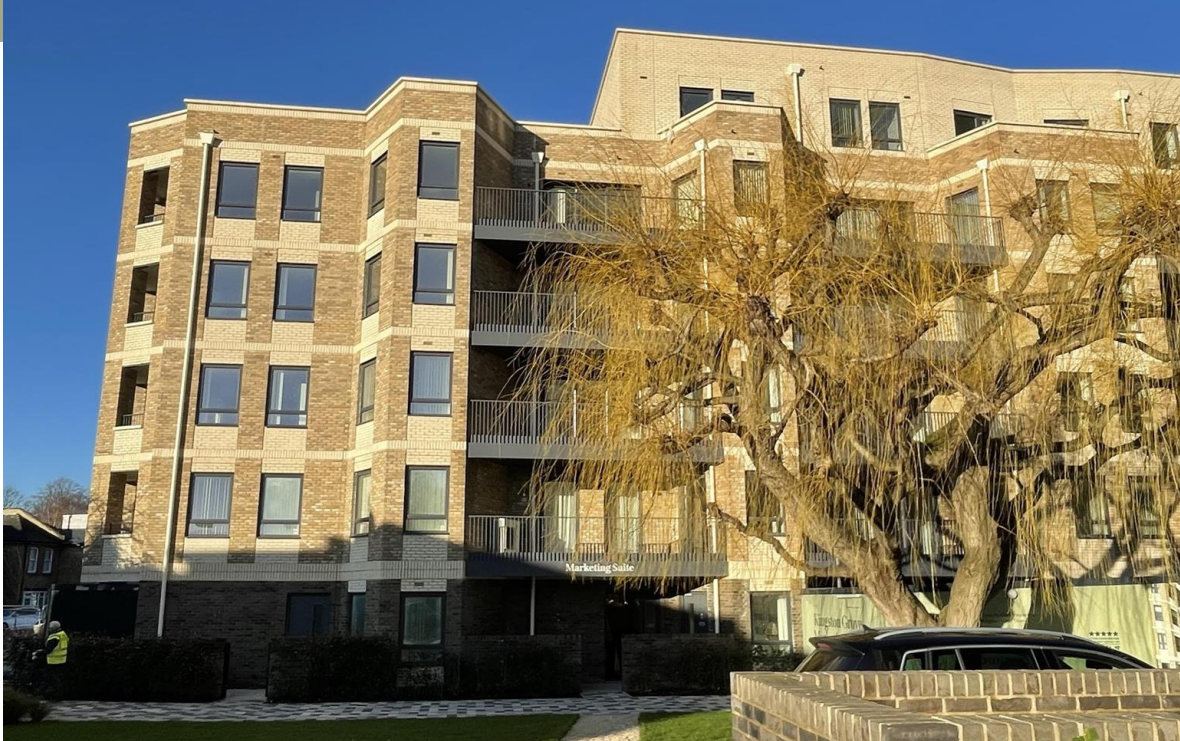
Photograph: Block B

This newsletter looks at the latest progress on Phase 1 of the regeneration at Cambridge Road Estate.