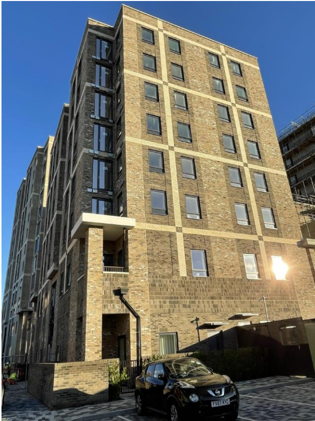
Photograph: Block E